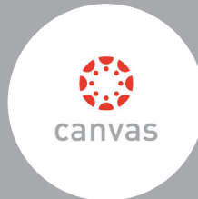
Canvas Learning Hub