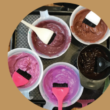
Company Education Advanced Colour