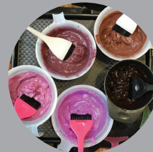
Intro to Colour