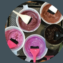
Company Education INTERMEDIATE COLOUR