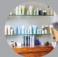
Company Education PRODUCT