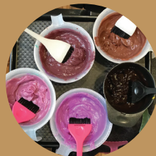
Lightening Colour Knowledge