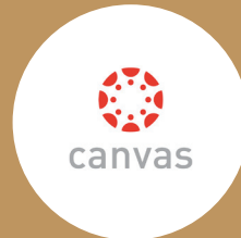
Canvas Learning Hub