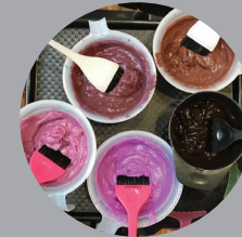
Company Education COLOUR