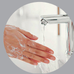
Health & Safety