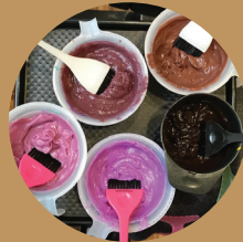
Advanced Colour Knowledge