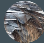
Foiling & Balayage