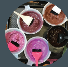
Company Education INTERMEDIATE COLOUR