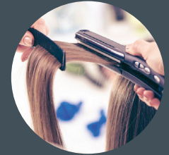
Company Education KERATIN / SMOOTHING TREATMENT