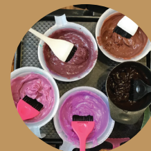
Company Education Advanced Colour